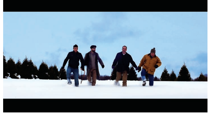
This still from the movie shows how Mother Nature provided snow at the right time for shooting